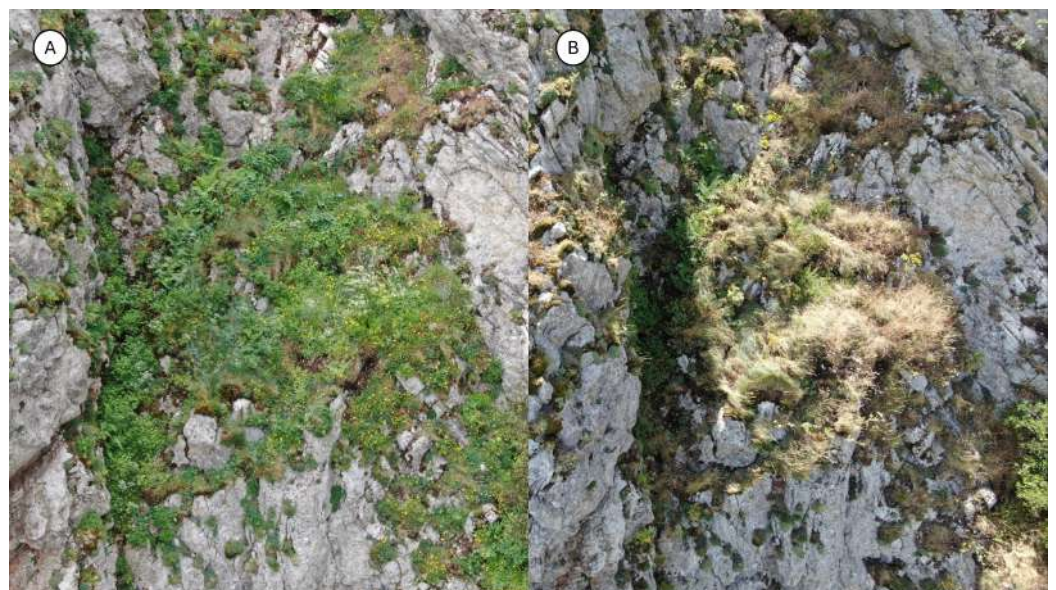
Figure 4. Vegetation changes between (A) May and (B) June (Rocca di Novara, Sicily), photos by G. Tavilla.

Based on our findings, managing the 3D rocky face model was easy with WebODM’s user-friendly interface (Figure 5). This interface allowed measurements of the basal leaves rosette diameter of the identified plants, and conducting population studies on rare species and vegetation sampling is now feasible (Table 1). Thanks to the phytosociological relevés carried out, it was possible to identify the habitat type in which this vegetation occurs. These rocky communities growing on the limestone side are included in habitat 8210 “Calcareous rocky slopes with chasmophytic vegetation”, which is listed in Annex I of Directive 92/43/EEC. This is a vegetation of fissures of limestone cliffs, in the Mediterranean region