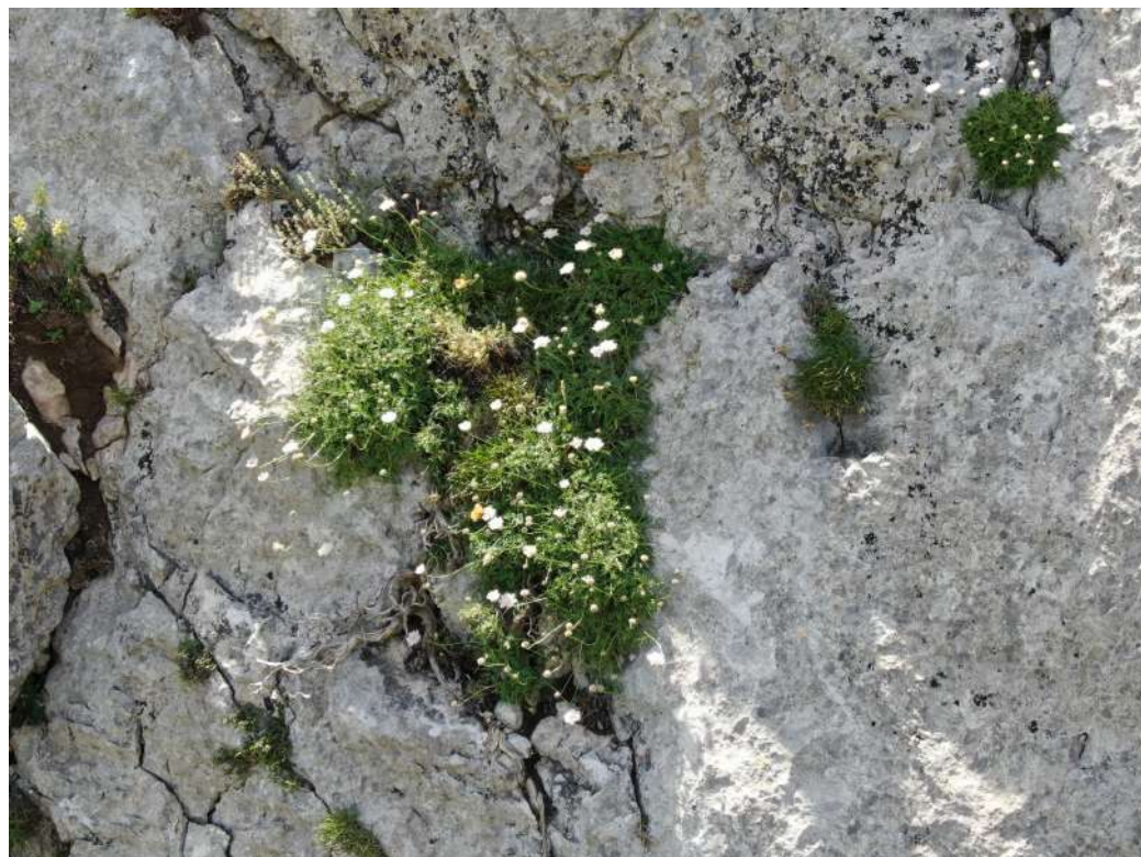
Figure 6. Lomelosia crenata (Cirillo) Greuter & Burdet subsp. crenata (Rocca di Novara, Sicily), photograph by G. Tavilla.