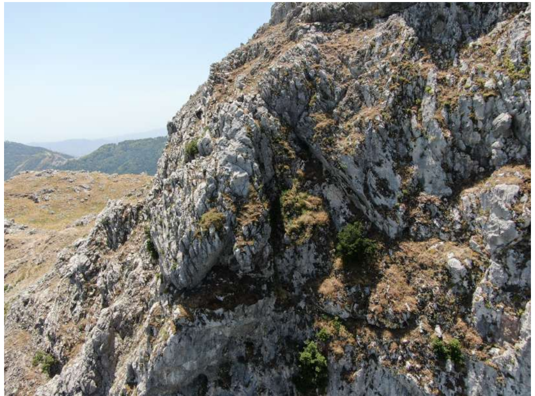
Figure 8. Inaccessible side of Rocca di Novara, photograph by G. Tavilla.