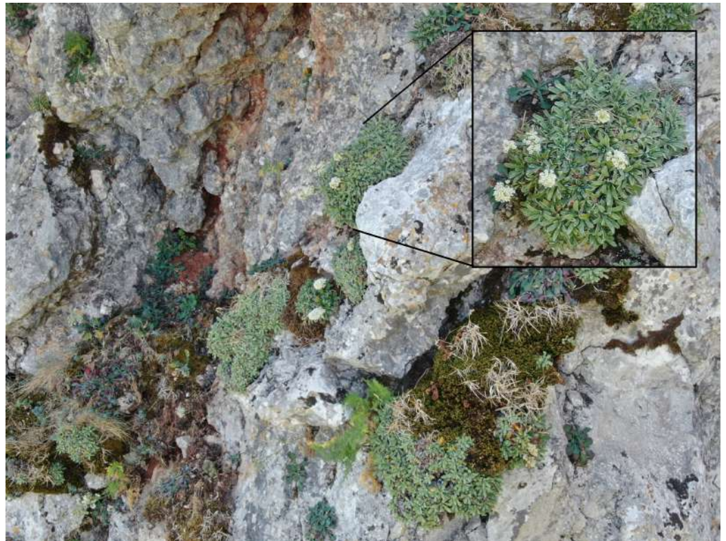
Figure 7. Saxifraga callosa subsp. australis (Moric.) Pignatti ex Tavilla & Del Guacchio (Rocca di Novara, Sicily), photograph by G. Tavilla.

Furthermore, it should be noted that O. bocconeii is not currently reported in the section “Other important species of flora and fauna” of the Rocca di Novara SAC data form [64].