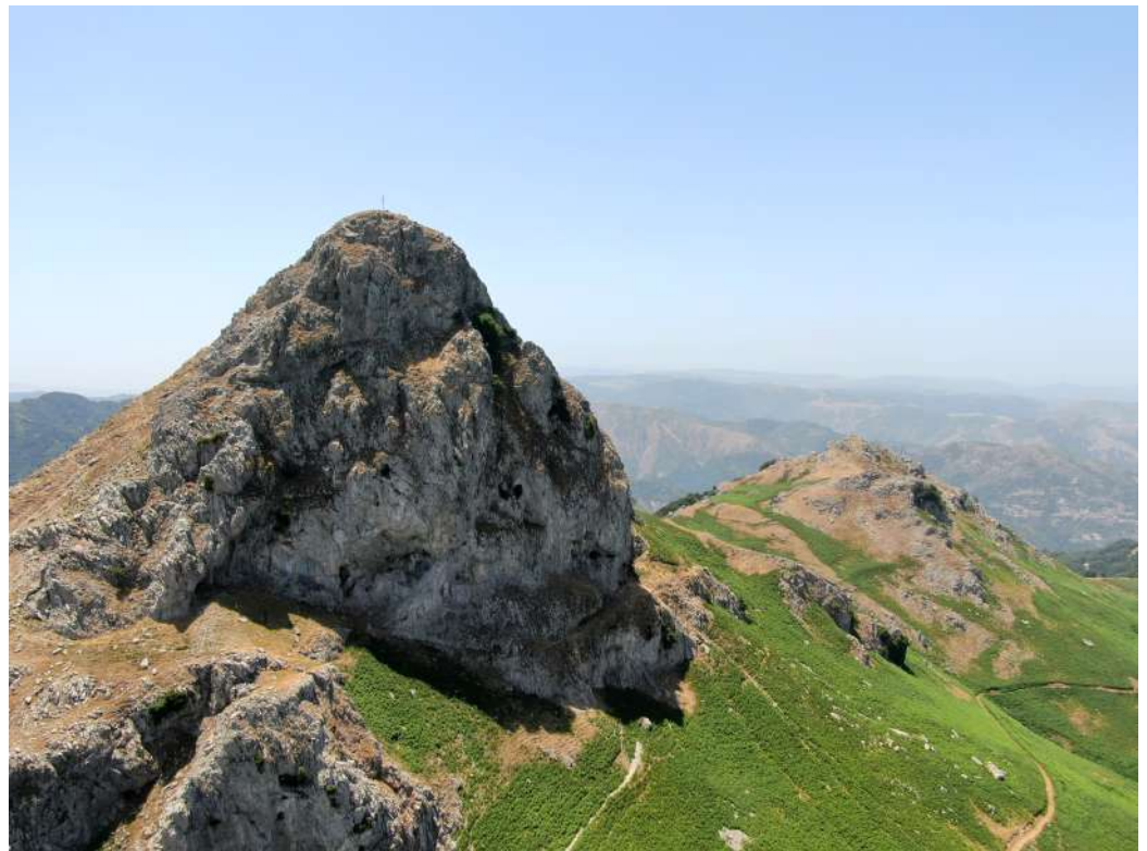
Figure 2. Rocca di Novara, Sicily (Italy), photo by G. Tavilla.

The main northern mountain range of the island, with the highest peak being Montagna Grande at 1374 m, is the Peloritani mountain range. In particular, for the goals of this study, the mountain Rocca di Novara ( 37^{\circ}59'39.49'' N 15^{\circ}08'49.08'' E, also known as Rocca Salvatesta) has been chosen as the study area. This peak is situated within the boundaries of Novara di Sicilia, located in the province of Messina [33]. Geologically, it is predominantly composed of limestone rocks, which makes it a peculiar feature in the Peloritani range, known for its metamorphic rock formations [34]. The Peloritani mountain range, including Rocca di Novara, makes it difficult for researchers to study its vegetation using traditional in-field techniques. This is why many regions within these mountains have not been thoroughly researched in terms of their vegetation and flora characteristics. The presence of limestone outcrops has resulted in a distinct and diverse floristic set, setting it apart from other peaks in the area. This area falls within the SAC “Rocca di Novara” (code ITA030006) due to its relevant naturalistic heritage (Figure 2). Moreover, Rocca di Novara belongs to the Important Plant Area (IPA) named “Monti Peloritani e Rupi di Taormina” [35].