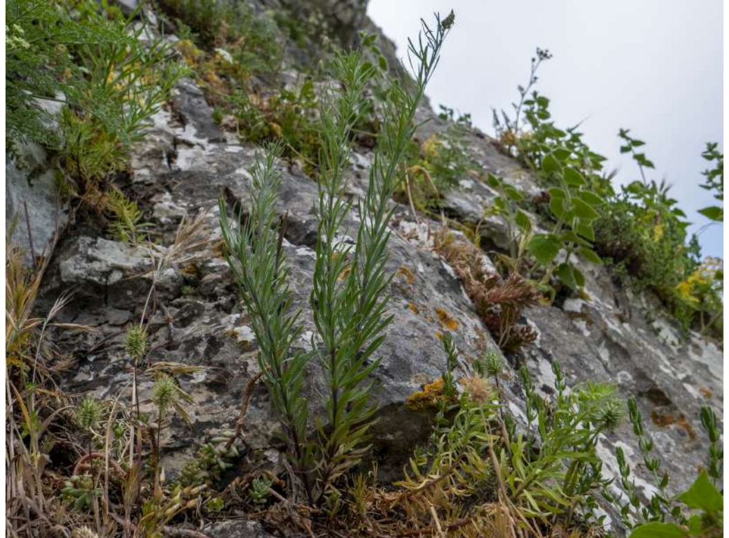
Figure 10. Odontites bocconei (Guss.) Walp. subsp. bocconei (Rocca di Novara, Sicily), photograph by G. Tavilla.