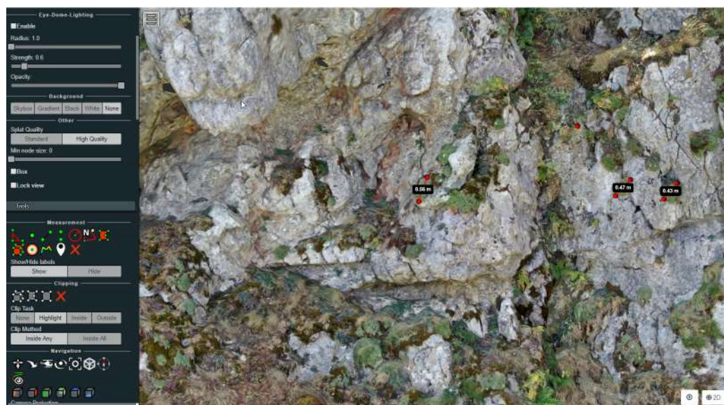
Figure 5. WebODM 3D model interface.

belonging essentially to the Saxifragion australis Biondi & Balelli ex Brullo 1984 ( Asplenietea trichomanis (Br.-Bl. in Meier & Br.-Bl. 1934) Oberdorfer 1977 class) [55].