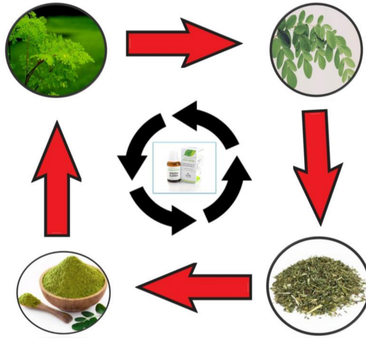
Figure 2. Main uses of Moringa : fresh, powder, as well as commercial preparations.

and poultry [123]. Some of the examples of the uses of Moringa in poultry production and health are given in Figure 3.