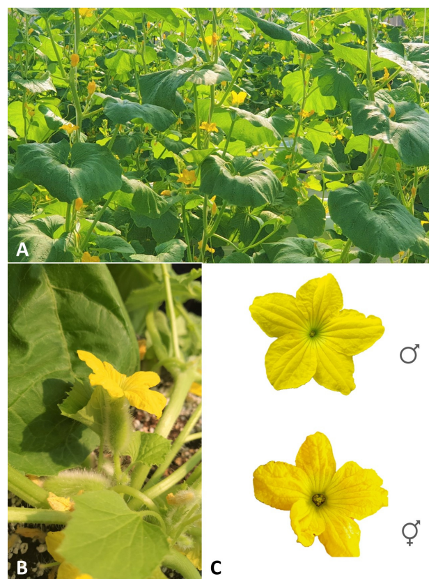
Figure 1. Plants of Scopatizzo with main stem vertically trained at full flowering stage (A). Side view of hermaphrodite flower of Scopatizzo (B). Top view of male (top) and hermaphrodite (bottom) flower of Scopatizzo (C).

Apulia region (Southern Italy) is an important secondary center of diversity for C. melo L. [6]. Several landraces of this species are still grown there including the so-called unripe melons, such as 'Barattiere', 'Carosello', 'Scopatizzo' (Figure 1), etc. [7–10].