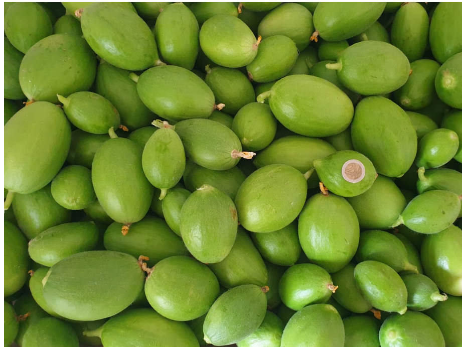
Figure 2. Fruits of Scopatizzo melon.

Although unripe melons, including Scopatizzo, are taxonomically C. melo , their fruits are harvested at the immature stage to be consumed fresh and raw, in salads or without dressings and are appreciated as an alternative to cucumber ( C. sativus ) due to their better-quality profile and for the absence of cucurbitacins [8,11]. Effectively, to our best knowledge, the literature lacks evidence with regards to cucurbitacins presence in these Apulian landraces of C. melo . Nevertheless, in the summer of 2022, the presence of bitter tasting ‘Scopatizzo’ fruits (Figure 2) was recognized during a genotype comparison trial in an experimental farm, thus suggesting the first-time presence of cucurbitacins in an Apulian landrace of C. melo . Notably, other warnings about bitter tasting ‘Scopatizzo’ fruits were received from local markets in 2022.