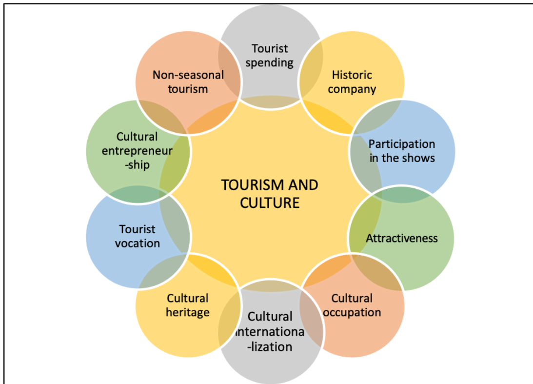
Figure 2. The ten indicators of tourist and cultural attractiveness

fifteen cities would be eligible (Roma, Milano, Torino, Genova, Bologna, Firenze, Venezia, Verona, Padova, Parma, Modena, Reggio Emilia, Bergamo, Trento, Piacenza).