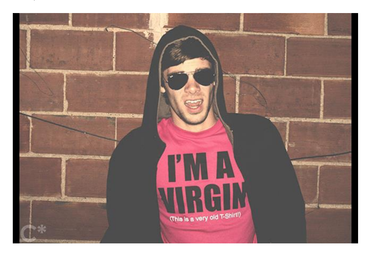
Figure 5 Young man wearing a printed T-shirt.

and humour to promote sexual diversity, as in the case of the Q&A related to Common Problems and entitled Is A 25-year-old Virgin Dude Something Weird? (2017). The post combines four visual elements depicting virginity, i.e. title, image, caption, body text. In the image caption, the concept is alluded to, whereas in the remainder of the web page the keyword "VIRGIN" is explicitly mentioned. More in detail, the image (Figure 5) represents a human participant (young man or dude ) wearing a hoodie, a pair of sunglasses and a printed T-shirt that says I'M A VIRGIN (This is a very old T-Shirt) .