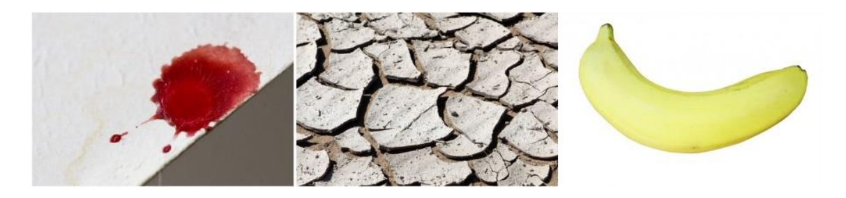
Figure 1 Graphic representations of word/patterns.

In the first case (Figure 1), images provide a graphic representation of words or patterns inserted into titles or otherwise recurrent in the body text (e.g. blood stains matching with the lemma "BLOOD" and its inflections; curved objects matching with the lemma "CURVE" and its inflections; cracked, dry soil matching with "DRY" and "DRYNESS"), replicating the aboutness of texts.