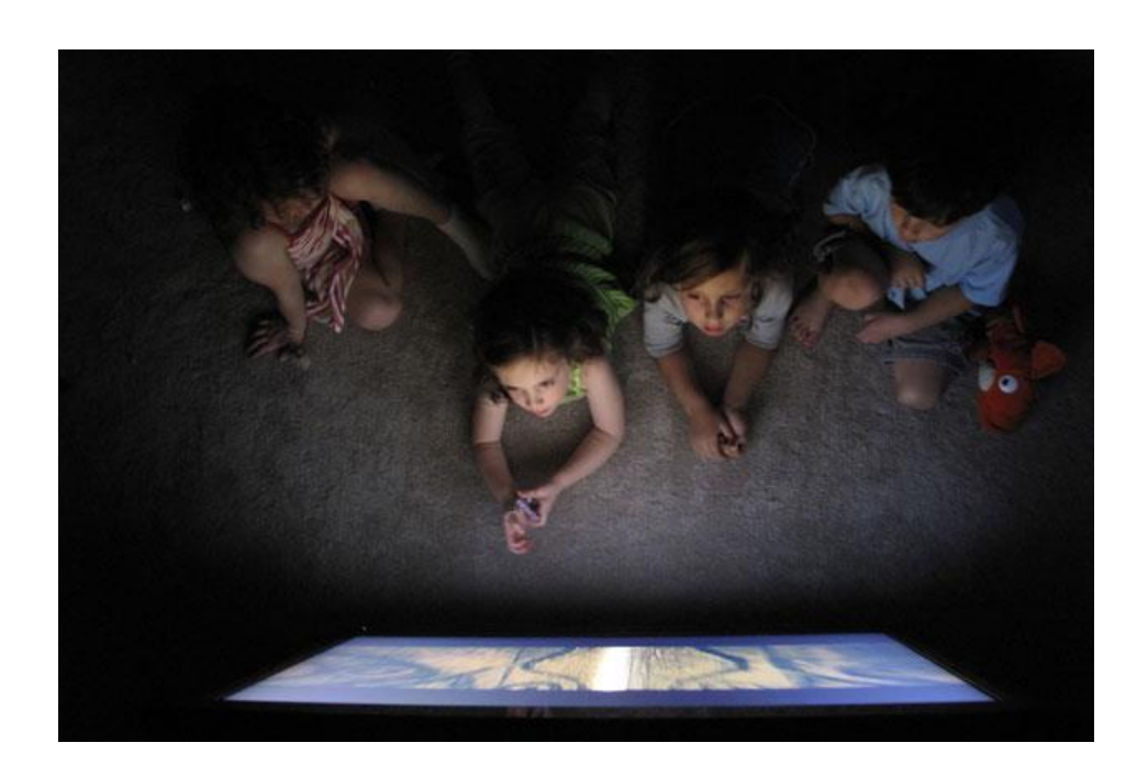
Figure 2 Example of an image supplying new information to texts.

In the third and last case (Figure 3), images focus on a particular word, depicting a specific element of the discourse (e.g. a couple of dolls under the blankets combined with the Q&A entitled Is fantasizing the same as cheating? ).