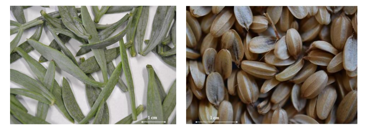
Figure 3. Leaves (left) and fruits (right) of sea fennel.

Crithmum maritimum L. is the only species of the genus Crithmum within the Apiaceae family. Sea fennel plants show many branches and succulent leaves (Figure 3) reaching a height up to 60 cm [11]. The blooming starts in June–September, while the fruits (Figure 3) do not begin to ripen before October–November [1].