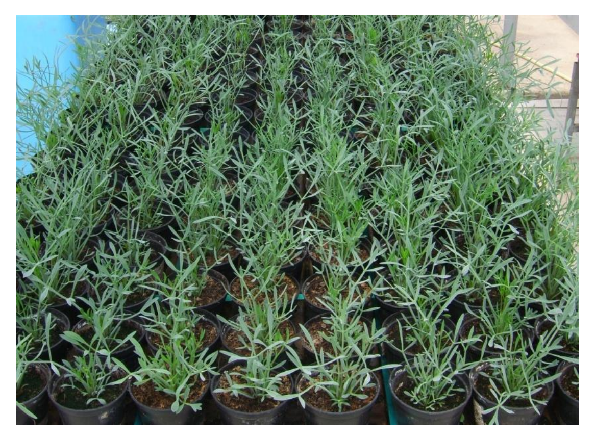
Figure 6. Potted sea fennel grown by using different posidonia compost-based substrates in comparison with peat [8].

Montesano et al. [6] evaluated the effect of posidonia compost-based substrates as a potential growing media for potted sea fennel cultivation (Figure 6). Following the harvest carried out 60 days after transplantation, these Authors found an average yield of about 5.4 g DW plant<sup>-1</sup> without significant differences between various substrates, suggesting the possibility to replace peat substrates with renewable media without a negative effect on yield and quality. Furthermore, these Authors hypothesized that the halophyte aptitude of sea fennel can help to overcome the limitations posed by the high salinity of some compost-based growing media [6].