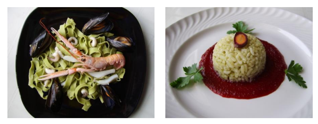
Figure 4. Green tagliatelle (pasta with sea fennel) in marinara style ( left ) and spiced "dome" (pilaf rice cooked with sea fennel) on puree of apple and purple carrot ( right ) [21].

other cases. For example, in green tagliatelle (Figure 4), the main coloring effect of the freeze-dried sea fennel was highlighted, while in rice pilaf (Figure 4) with air-dried sea fennel the main spiced effect was reported as a primary trait [21].