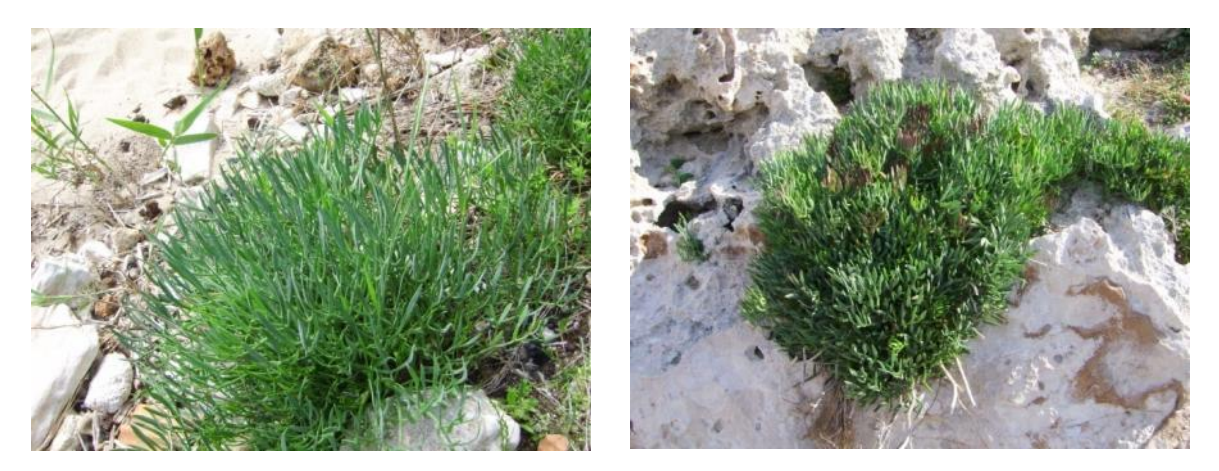
Figure 1. Plants of sea fennel on a sandy beach ( left ) and maritime rocks ( right ). Adapted from Renna et al. [2].

Sea fennel ( Crithmum maritimum L.) is a perennial halophyte also known as samphire, crest marine, marine fennel and rock samphire which grows spontaneously on sandy beaches, maritime rocks, breakwaters and piers (Figure 1) of all the world's coastlines, being particularly abundant along the coasts of Mediterranean countries [1].