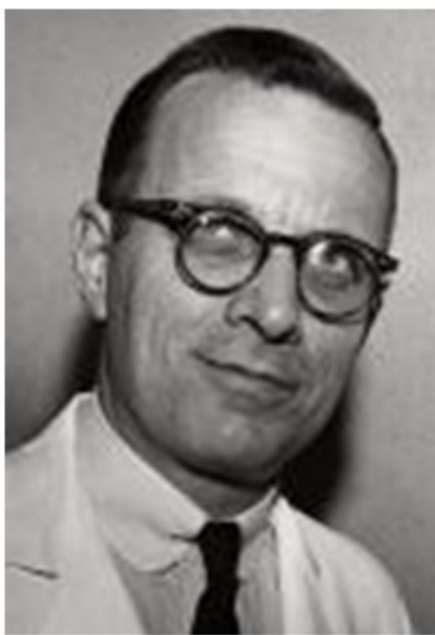
Figure 2: A portrait of Lewis Thomas.

About 5% of individuals with primary or secondary immunodeficiencies and individuals subjected to therapy to prevent transplant rejection present a heightened incidence of cancer [31]. Cancers most commonly found in immunodeficient individuals are virus-associated [32], including Epstein-Barr virus-related tumors [33, 34]. Failure of human herpes virus (HHV) immune response is one of the factors involved in the pathogenesis of Kaposi sarcoma [35]. Several other cancers, have increased