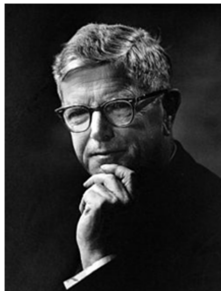
Figure 3: A portrait of Frank MacFarlane Burnet.