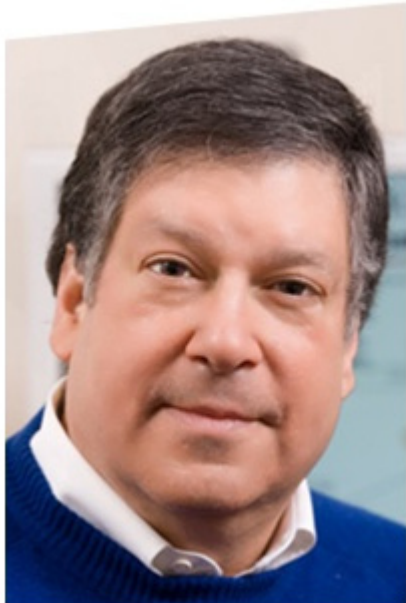
Figure 4: A portrait of Robert D. Schreiber.

incidences in persons with human immunodeficiency virus (HIV)/AIDS, including hepatocellular carcinoma, which is frequently associated with infection with the hepatitis B or C virus [36]. Merkel cell carcinoma, a rare skin cancer that occurs more frequently after organ transplantation or B-cell malignancy, conditions of suppressed or disordered immunity, has an increased incidence in HIV-infected individuals [37].