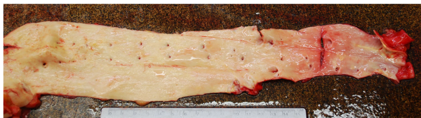
Fig. 5 Injury of the abdominal aorta

The man had been unemployed for 19 years before the crime, when he underwent his first psychiatric admission due to acute delusions; he was then diagnosed with a bipolar disorder. An initial unspecified psychopharmacological therapy was introduced, and the case notes analysis revealed good treatment adherence and a diagnostic change to a delusional disorder. Following a readmission 12 years prior to the crime, he was diagnosed with “depression and personality disorder”. At the time of the crime he was supposed to be taking prescribed quetiapine and lithium carbonate.