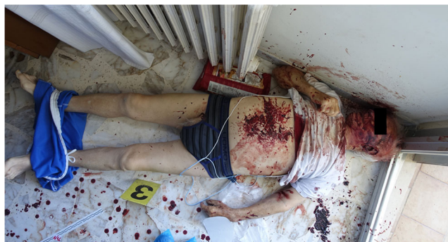
Fig. 1 Victim lying on the floor with his head adjacent to a broken marble baseboard, holding a bread knife in his right hand

The victim was lying supine on the floor with his head adjacent to a broken marble baseboard. He was wearing a white t-shirt that had been raised above the chest, a pair of male underpants, and a pair of shorts that had been lowered to the ankles. He was holding a bread knife loosely in his right hand (Fig. 1); the blade measured 20 cm in length and 2.5 cm