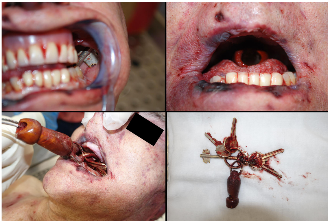
Fig. 3 Set of keys with keychain in the oral cavity