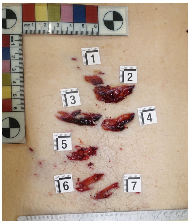
Fig. 4 Skin lesions showing a single pointed end and a unilateral “fish tail” split

Hemorrhage infiltrates were revealed on the greater omentum and the mesentery. The volume of the hemoperitoneum was nearly 1.5 l and we observed a retroperitoneal hematoma that involved an area comprised of the left kidney fibrous and adipose tissues, the psoas muscles, and the surrounding bladder space. No skeletal fractures were observed. Toxicological analyses were negative.