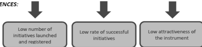
Figure 1. Framework of the reform