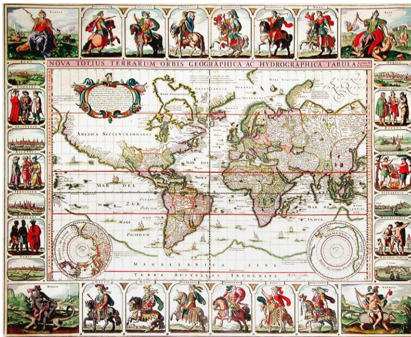
Nova Totius Terrarum Orbis Geographica Ac Hydrographica Tabula, 1652

the historicity of geography 1 : a Japanese person may call Egypt the “Near East” and an Italian consider Morocco “Oriental”. In short, history has made geography unreal and time, since the inception of the modern/colonial world, “has functioned as a principle of order that increasingly subordinates places, relegating them to before or below from the perspective of the ‘holders (of the doors) of time’” (Mignolo 2002: 67; my emphasis). By the end of the 19 th century, the masters of historical time completed the colonial work of translating space into time, according to the ideology of linear progress still dominant today. Furthermore, in the second half of 16 th century, with Flemish cartographer Gerardus Mercator, mapmaking abandons its mimetic aspirations in favour of representation. The Mercator projection, conceived for the use of marine navigation, distorts geographic spaces: objects appear larger the further they are from the equator and, thus, Northern landmasses are grotesquely aggrandised. Therefore, not only does the North dominate the South by being seated above it, but it does so with its fictional vastness. Local Western enunciation has created a global fictional enunciated we all see on maps even today. The same can be said of iconography.