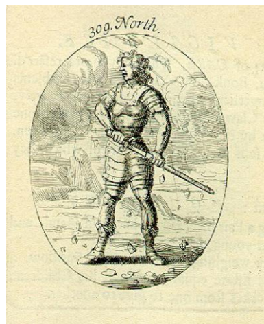
Images from C. Ripa's Iconologia or Moral Emblems , 1709 English edition.

In conclusion, in 17 th century learned imagery, the South was meek and black, the North white and brave. "Naked" continents were barbarian and, therefore, disconnected from culture, while "richly dressed" Europe was civilised and controlled nature. Barbarism, being a matter of location and not time yet, was in the "undressed" continents (the West Indies and Africa), civilisation in the "dressed" continent of Europe.