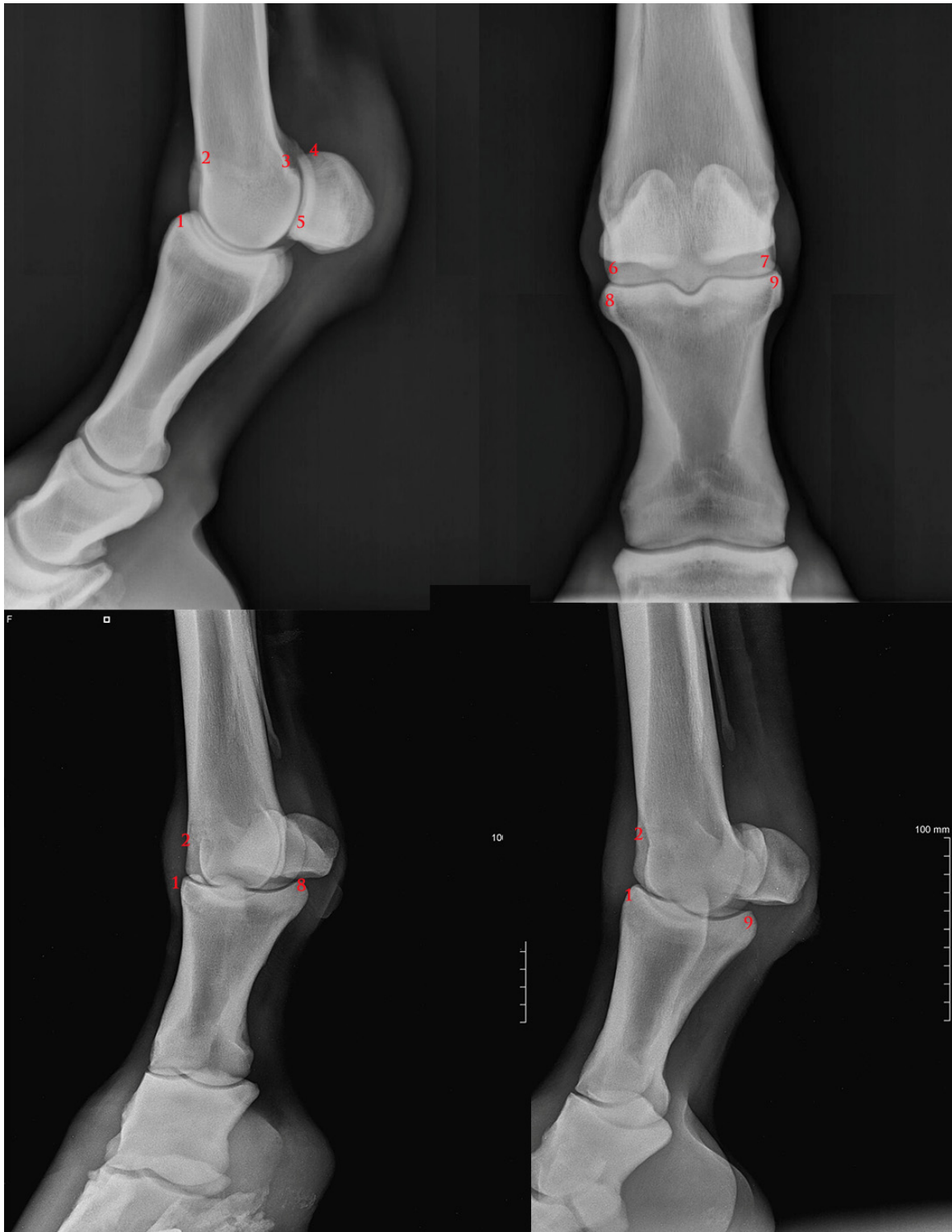
Figure 1. Anatomical assessment point description: 1) P1 dorso-proximal margin; 2) MC3 dorso-proximal margin; 3) caudo-proximal supracondylar margin; 4) PSB proximal margin; 5) PSB distal margin; 6) MC3 lateral margin; 7) MC3 lateral margin; 8) P1 medial margin; 9) P1) lateral margin. P1: 1st phalanx; MC3: 3rd metacarpal bone; PSB: proximal sesamoid bones.