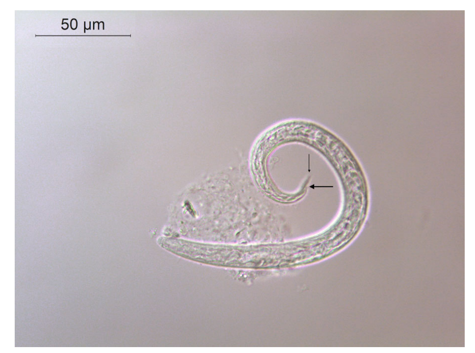
Fig. 3. Filaroides hirthi first stage larva detected at the microscopic examination of the BALF (40x magnification). Note the straight tail with a single slight dorsal indentation (thick arrow), ending into a lance-like shape (thin arrow), consistent with F. hirthi .

opacities with patchy distribution, and direct microscopic examination of BALF revealed once more the presence of live F. hirthi L1s. Thus, fenbendazole treatment (50 mg/kg per os for two weeks) combined with three subcutaneous off-label administrations of ivermectin (0.4 mg/kg, once every two weeks; Ivomec<sup>®</sup>; Merial), were performed. One month later, the thoracic CT showed normal lung patterns, and no larvae were detected at two BALF microscopical examinations performed one month apart.