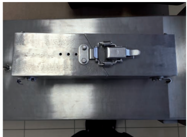
Figure 1. Rendering of the device used to measure the air permeability of nets and fabrics at different inclinations. Specimen holder to set up the different inclinations: the picture refers to the specimen holder 60^\circ .