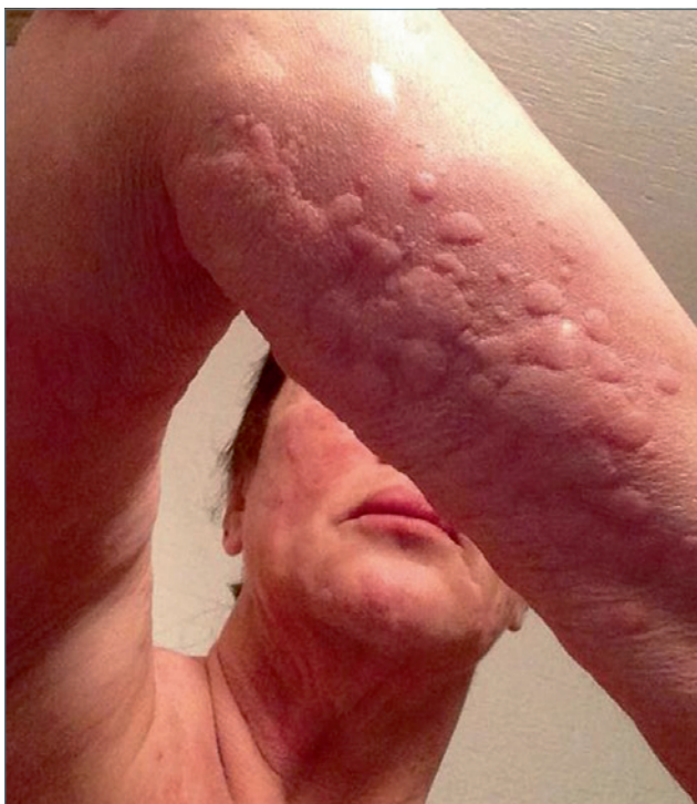
Figure 1. Generalized urticaria induced by ibuprofen intake.