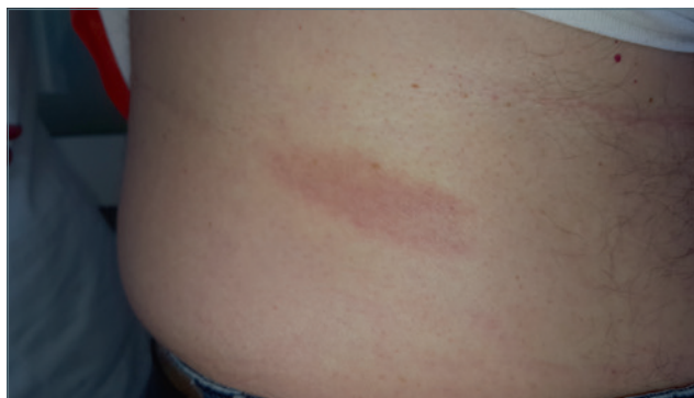
Figure 3. Fixed drug eruption.

mucositis of more than 2 districts. It can be preceded by macules and widespread flat target lesions. Early painful erythema of palms and feet is a typical feature. Fever and influenza-like symptoms may be present. In SJS the affected skin area is less than 10%, in TEN the detachment involves more than 30%. In between lies the SJS/TEN overlap syndrome 6,16 . The onset is usually 4-28 days after the start of the offending drug 17 .