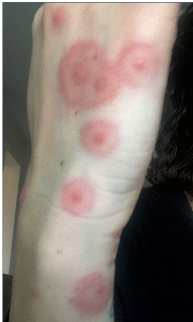
Figure 4. Erythema multiforme mayor associated to viral infections.

DRESS is one of the most common SCARs with an estimated prevalence of 1-4 per million. The eruption is most commonly urticaria-like or an exanthema. The onset is usually 2-6 weeks after the initiation of drug therapy. Fever, facial and acral edema, lymphadenopathy, leucocyte abnormalities (leukocytosis, eosinophilia and/or atypical lymphocytosis), hepatitis, non erosive mucositis, nephritis, pancreatitis, pneumonitis and myocarditis have been reported. It can be associated with reactivation of human herpesvirus-6 and -7 and Epstein-Barr virus. Advanced age and renal failure are risk factors for DRESS. Mortality rate is estimated at 10% 6 .