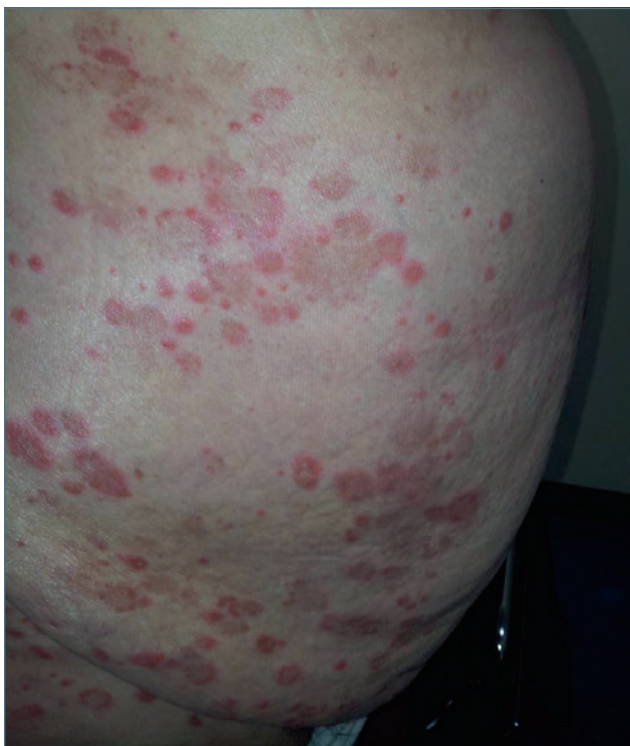
Figure 5. Target lesions induced by drug intake.

the use of numerous drugs and immune system modifications predispose to drug-induced adverse reactions, the incidence of which is directly correlated with the number of pathologies that elderly people are suffering from 18 . “Danger signs” of delayed cutaneous drug reactions are intense facial involvement, atypical target or bullous lesions, epidermolysis, hemorrhagic necrotizing lesions, purpura, widespread dark-red erythema, extensive pustulosis, painful skin, mucosal involvement, generalized lymphadenopathy, epatopathy, nephropathy 19 . Management of drug hypersensitivity reactions include prompt diagnosis, removal of the culprit drug and early treatment.