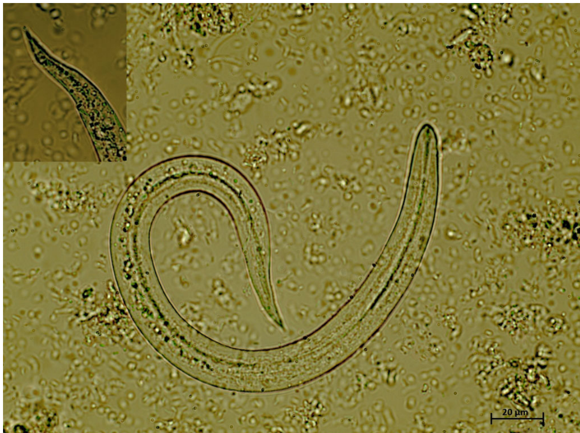
Fig. 2. Crenosoma vulpis first stage larvae detected at the Baermann technique, 40x magnification. Note the filiform C-shaped larvae with conical tail, consistent with C. vulpis

After the visualization of the nematode in the respiratory tract, an enema was performed to collect fresh faecal samples. Qualitative floatation analysis and sedimentation test were negative. The sediment collected from the Baermann apparatus revealed the presence of several motile larvae under light microscopy. A quantitative Baermann was performed, revealing 6066 larvae per gram of faeces (LPG). Several filiform C-shaped larvae were visualized, 260 – 290 µm long and 12 – 14 µm wide, consistent with C. vulpis L1 (Fig. 2). Regarding the molecular identification, the 12S rDNA sequences obtained from the collected larvae (accession no.