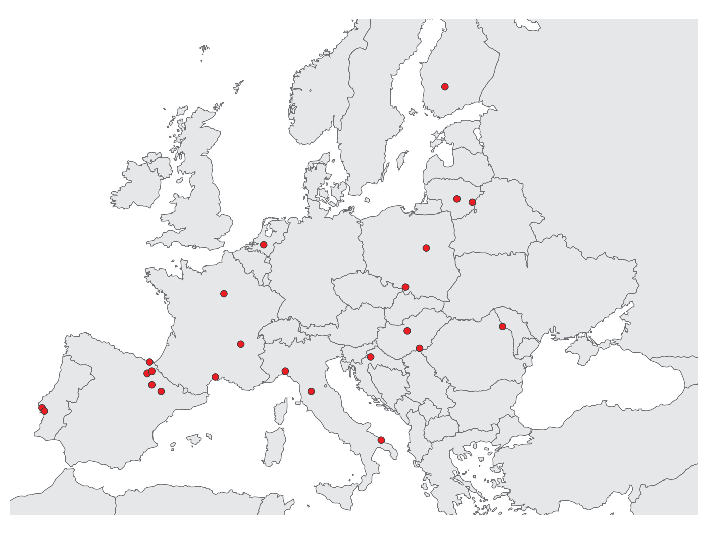
I MOVE+: Integrated Monitoring of Vaccines in Europe plus.

Location of the hospitals participating in the I-MOVE+study, Europe, influenza season 2015/16 (n = 27 hospitals)