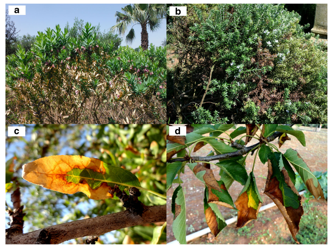
Fig. 2 Symptoms on host plants infected by Xylella fastidiosa strain CoDiRO. Infected hosts were identified during surveys made in the infected area during summer 2014. a Polygala myrtifolia ; b Westringia fruticosa ; c Prunus amygdalus ; d Prunus avium

of the seven MLST loci were shared between ST53 and ST73 (Table 2); however, the alleles for the other three loci were phylogenetically clustered together (Fig. 3), suggesting that these STs have a shared evolutionary history. All loci from ST53 and ST73 belonged to well supported monophyletic groups with other alleles originated from isolates that cluster with X. fastidiosa subspecies pauca . The phylogenetic network derived from all MLST data publicly available indicated, as expected