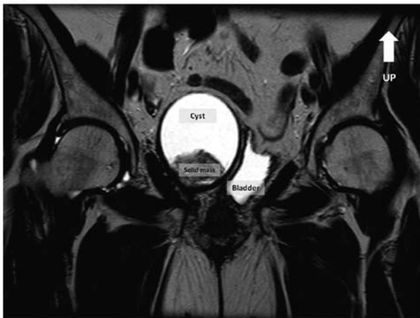
Figure 2. Magnetic resonance imaging confirmed the presence of a cystic lesion with a thick solid inner area.

abscess was established, and one month subsequent to surgery the irritative voiding symptoms experienced by the patient had completely ceased.