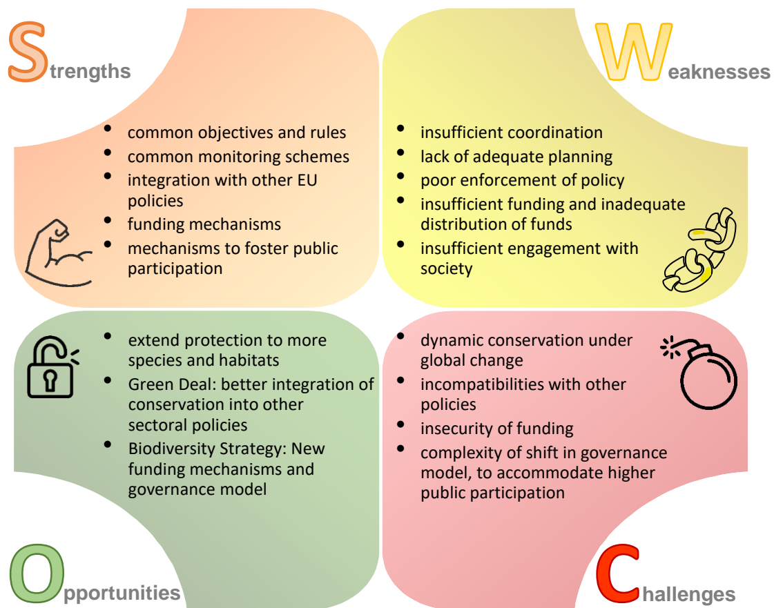
Figure 1. Strengths and weaknesses of past conservation policies and practice in the European Union, as well as opportunities and challenges for conservation in the coming decade.