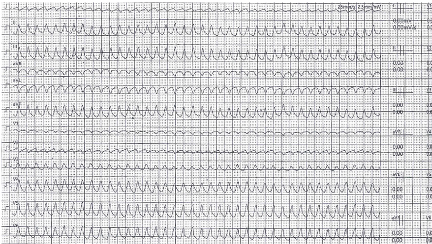
Figure 1 Sustained ventricular tachycardia during ergometric stress. Cardiomyopathy electrical complications often anticipate mechanical ones: Life-threatening ventricular tachyarrhythmias may be the first clinical manifestation of the disease.