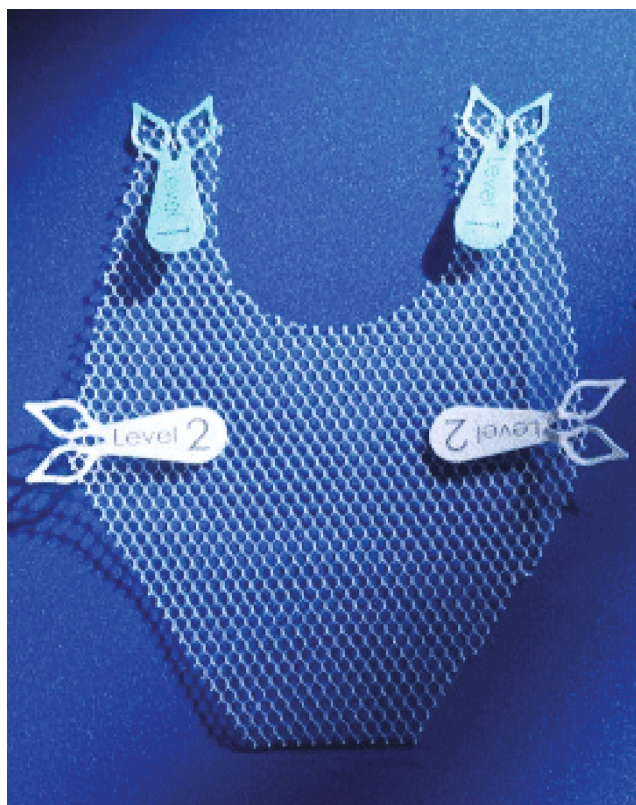
FIGURE 1: InGYNious (A.M.I., Feldkirch, Austria) ultralightweight, monofilament polypropylene mesh ( 21 \text{ g/m}^2 ), with a hexagonal structure and six-point suture fixation (three-level support), consisting of extralarge micropores of 100 to 150 \mu\text{m} and macropores with diameters of 1.9 (uniform) to 2.8 \text{ mm} (maximum).