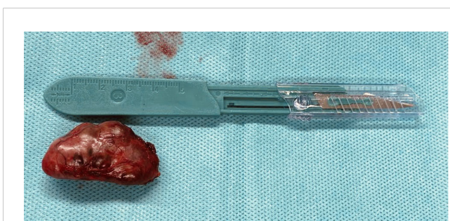
FIGURE 2 Parathyroidectomy.

The prevention of PC is difficult and the best expectation is to develop a specific genetic analysis and preoperative diagnosis method. In 2017, Silva-Figueroa et al. (20) proposed a prognostic scoring system to detect PC. The score was based on three risk groups (low, moderate and high) according to three main variables and the recurrence-free survival rate. Although this score is still not validated, it could be associated with clinical, genetic and