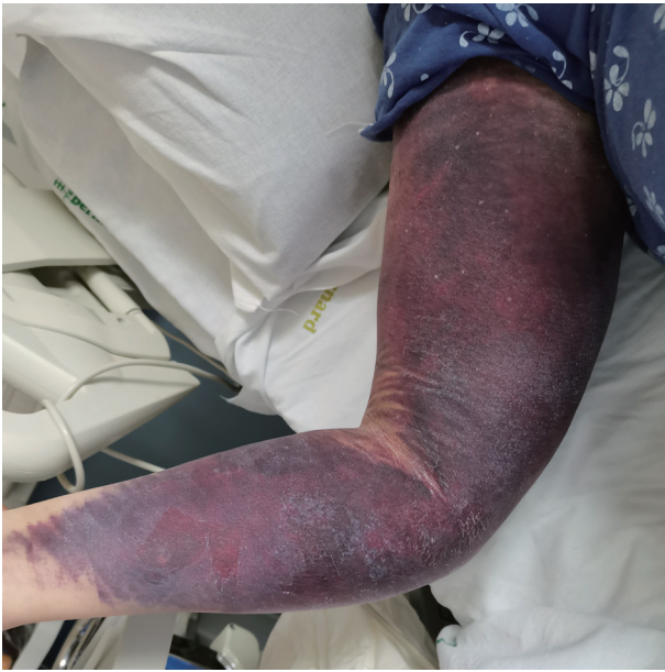
Figure 3. Right upper limb hematoma due to blood sampling, occurred during therapy with recombinant porcine factor VIII.