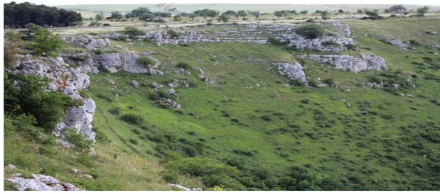
Figure 1. Typical landscape of Murge plateau.

reestablish native forestry species, such as several oaks, walnut, linden, etc., that need higher level of soil quality in comparison to pioneer forestry species.