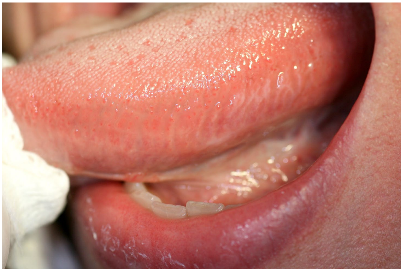
Figure 3. Left border of the tongue two weeks after the amalgam removal. Mucosal signs were strongly improved. The patient reported no symptoms.