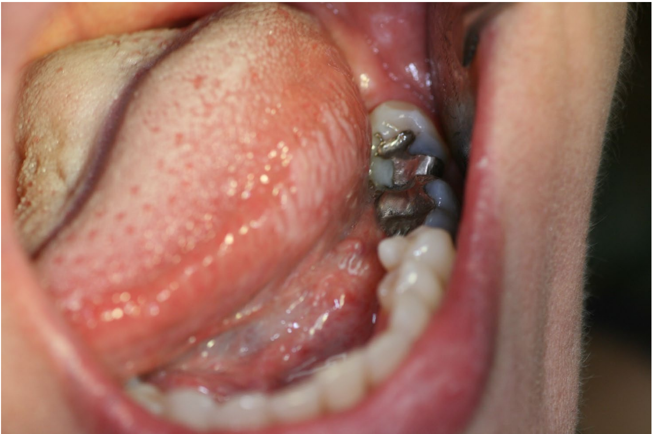
Figure 1. White corrugated lesion measuring 20 × 15 mm on the left dorsal border of the tongue. Presence of two amalgam fillings on 3.6 and 3.7 teeth.