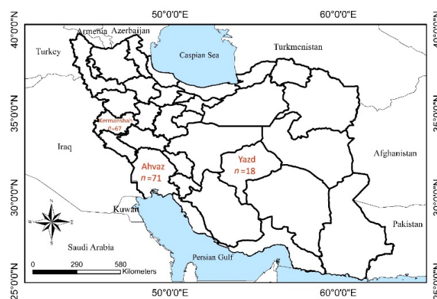
Figure 1. Sampled localities in Iran. Three different provinces were selected with different climate conditions, and in each city the main shelter where dogs are rescued from all over the province was sampled.

Between October 2018 and November 2019, a total of 156 rectal swabs were collected from dogs in 3 Iranian provinces in the south-west (Ahvaz; n = 71 ), west (Kermanshah; n = 67 ) and center (Yazd; n = 18 ) of the country. According to the Köppen–Geiger climate classification system [21], Ahvaz has a mid-latitude steppe and desert climate (Bsh) with an annual rainfall of 215 mm, Kermanshah has a warm and temperate climate (Csa) with the annual rainfall of 437 mm, while Yazd has a completely desert and dry climate (BWh) with about 55 mm precipitation annually (Figure 1).